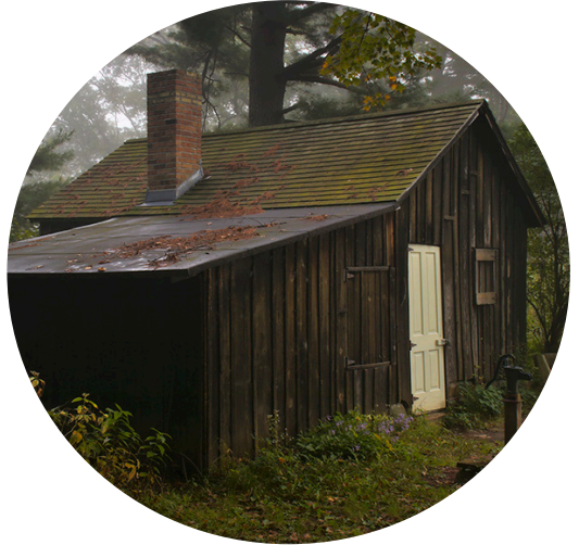
The historic Aldo Leopold Shack.