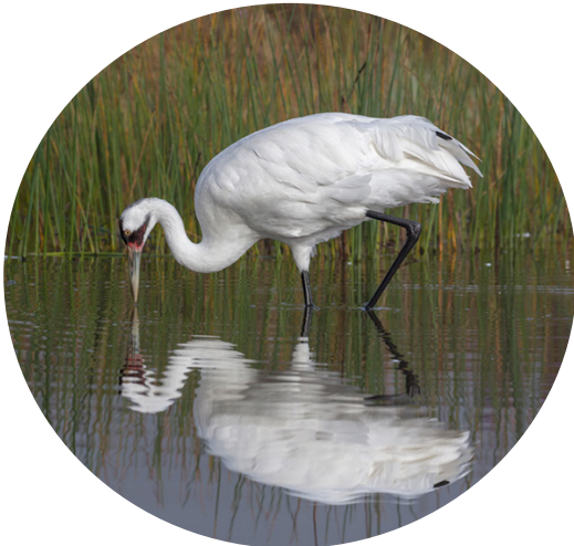
The celebrated Whooping Crane Exhibit at the International Crane Foundation.

The International Crane Foundation works worldwide to conserve cranes and the ecosystems, watersheds, and flyways on which they depend. We provide knowledge, leadership and inspiration to engage people in resolving threats to cranes and their diverse landscapes. From our nearly 300-acre headquarters in Baraboo, Wisconsin, USA, our reach extends across the globe. We have offices and staff in China, Uganda, Kenya, Rwanda, Zambia and South Africa, as well as Texas, and work through strong partnerships with local organizations, governments, universities, businesses and others in these regions. Our more than 125 staff and associates work with a network of hundreds of specialists in over 50 countries on five continents.